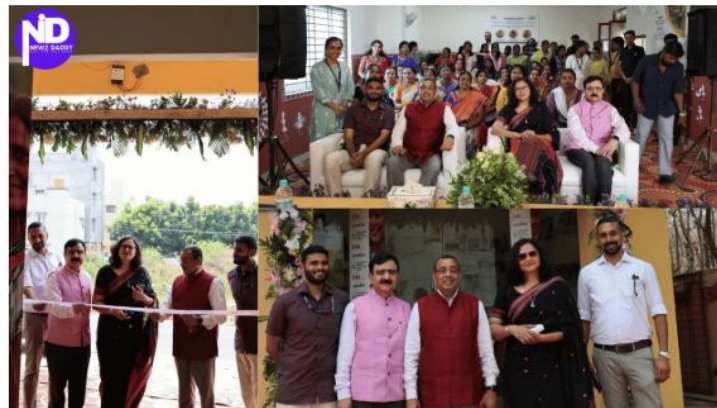
Sustainable Rural Entrepreneurship Boost in Bangalore Sparks Hope