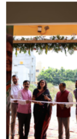
Dignitaries inaugurate the Eco Action Learning Centre, marking a major step towards sustainable rural entrepreneurship and green skill development.