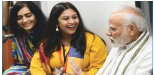
Hon'ble Prime Minister, Shri Narendra Modi interacting with EDII promoted women entrepreneurs.