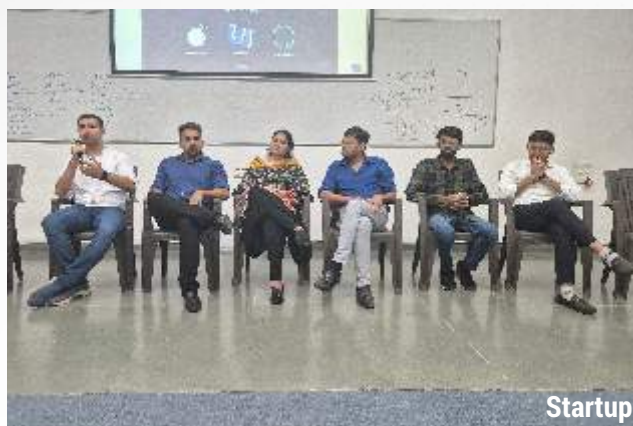
Startup Growth Conversation