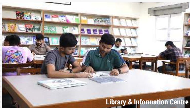
Library & Information Centre