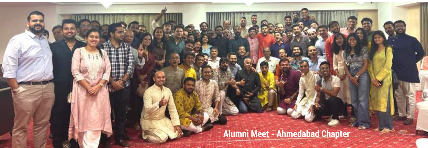
Alumni Meet - Ahmedabad Chapter

Promoter: Suvit Consultancy Services LLP