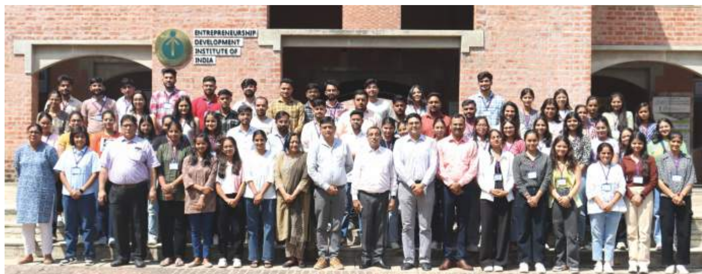
Participants of 'Agri Entrepreneurship' from Haryana Agriculture University, Hissar.

It is worth mentioning that the Institute designs and conducts agri-entrepreneurship-based programmes for international participants under the aegis of the Indian & Technical Economic Cooperation Division of the Ministry of External Affairs, Govt of India.